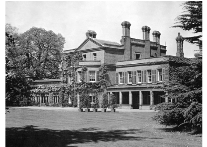
SBC London's evacuation premises, 1940.

The destruction caused by the First World War and its aftermath affected certain Swiss companies and industries in particular. One example of them receiving assistance with rebuilding came in 1922, when SBC celebrated its 50th anniversary and marked the occasion by giving each of its employees a Swiss pocket watch. The gifts provided invaluable support to the Swiss watch industry, which had seen a dramatic reduction in exports to the US. By the early 1920s, the number of SBC employees passed 2,000 for the first time, and stood at 1,000 at the Union Bank of Switzerland, showing that the economic impact of the war upon the two banks had not been dramatic.