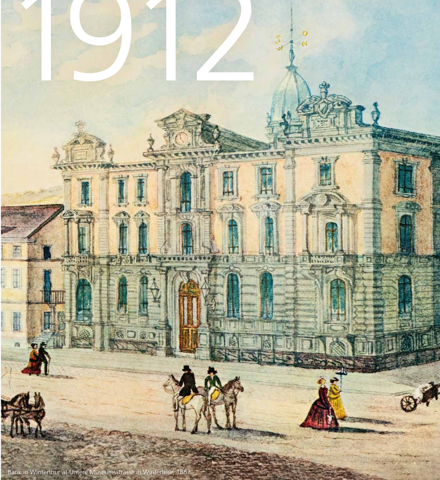
Bank in Winterthur at Untere Museumsstrasse in Winterthur, 1867.