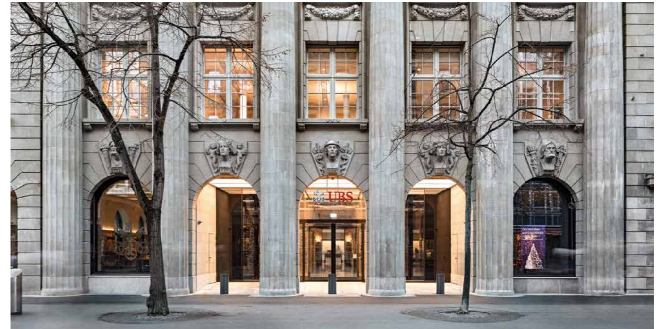
Headquarters of UBS at Bahnhofstrasse 45, Zurich.

In more recent years, our firm has achieved growth organically. We've leveraged our global network and experience, and formed groundbreaking joint ventures in growth markets. In China, UBS Securities – which celebrates its 15th anniversary this year – was the country's first