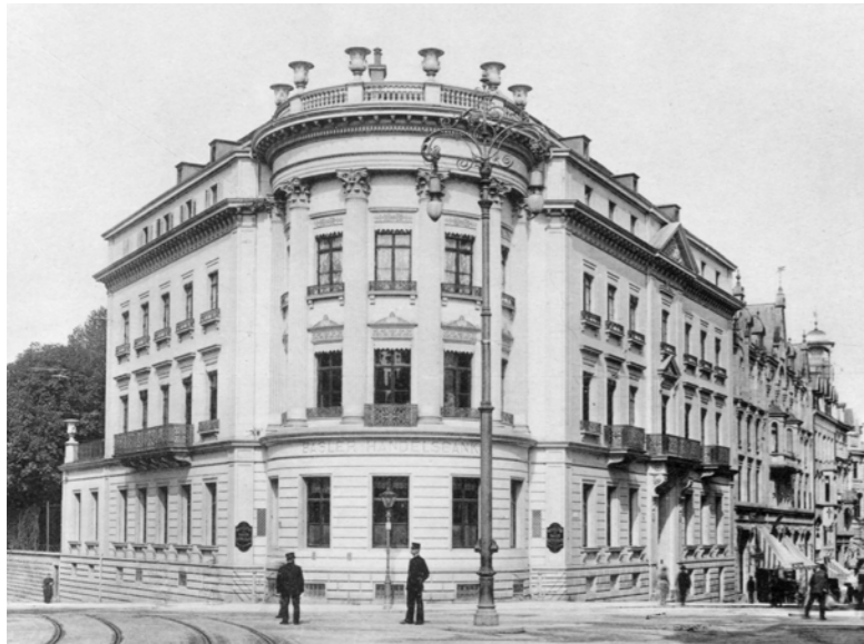
The headquarters of the Basler Handelsbank in Basel, about 1900.