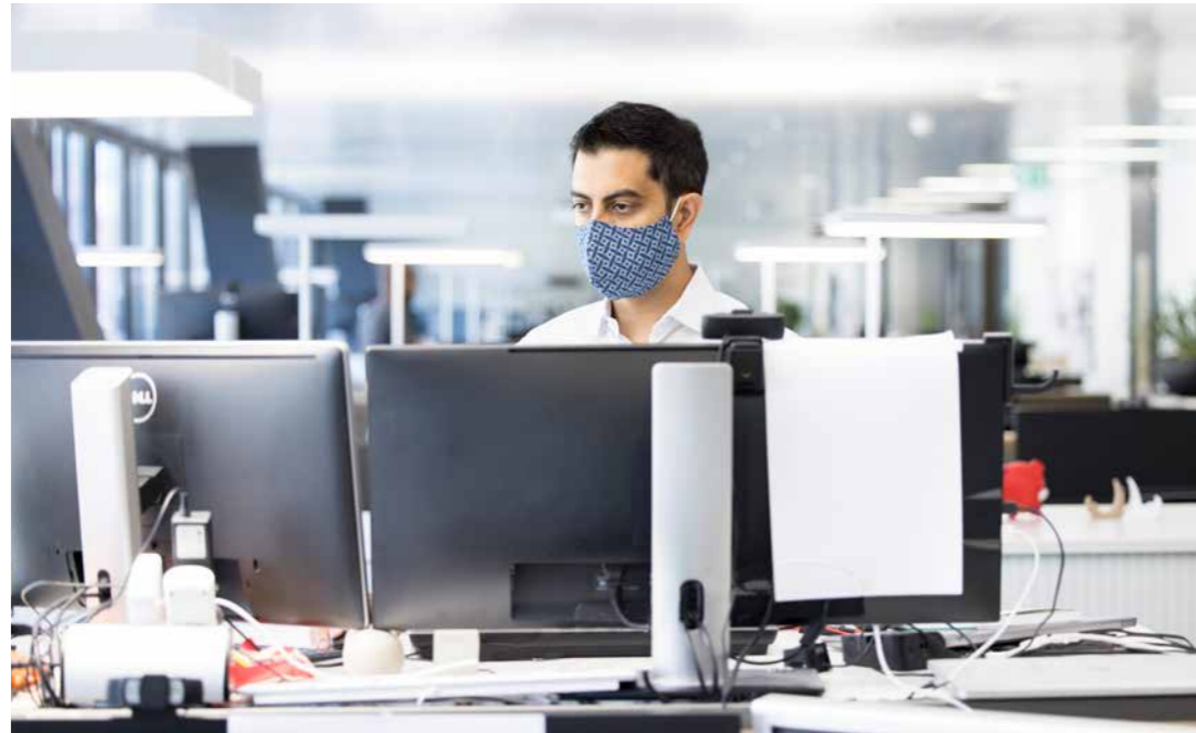
Empty offices during the COVID-19 pandemic, 2020.

financial institution to make sustainable investments the preferred solution for private clients investing globally. In 2021, the activities of UBS and Society became incorporated into the new Group Sustainability and Impact organization, with Planet, People, Partnerships as its focus themes. As part of this, our Community Impact program acts as a powerful vehicle to address issues associated with wealth inequality by generating social impact and to mobilize employees. For example, we work with our local communities to understand the social issues they are facing, we develop long-term partnerships with our communities to help address those issues, we focus on education and skills to catalyze sustainable change in people’s lives, and we enable our employees to help deliver this change through volunteering.