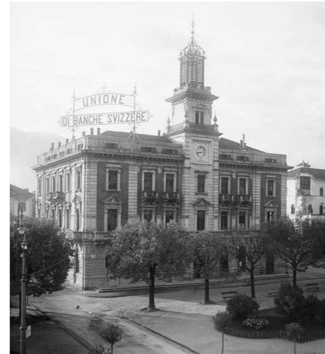
Union Bank of Switzerland in Locarno, 1930.