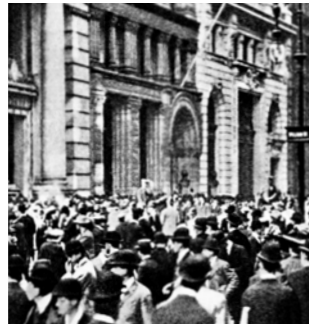
Black Friday, New York, October 1929.