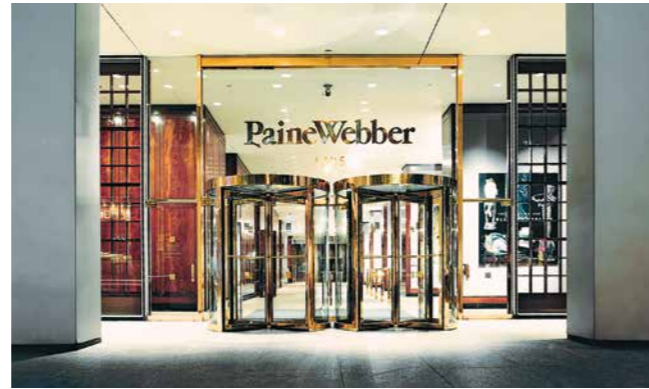
PaineWebber, Avenue of the Americas, New York, 1985.