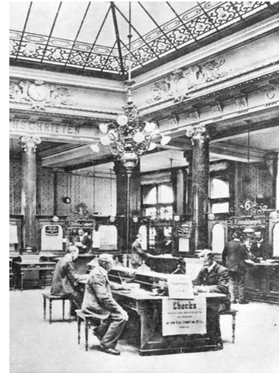
Banking hall of SBC in St. Gallen, about 1900.