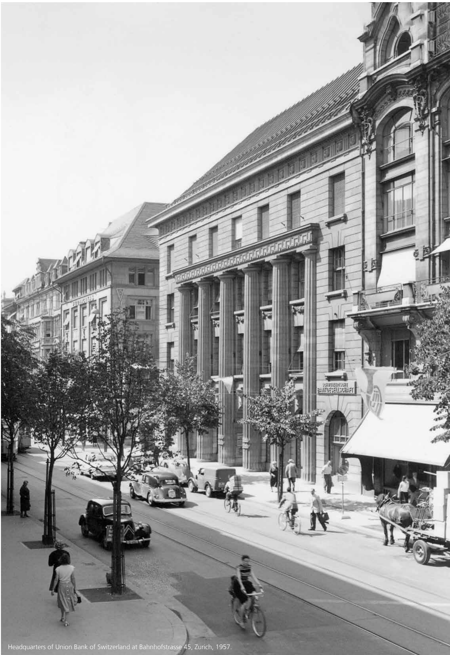
Headquarters of Union Bank of Switzerland at Bahnhofstrasse 45, Zurich, 1957.