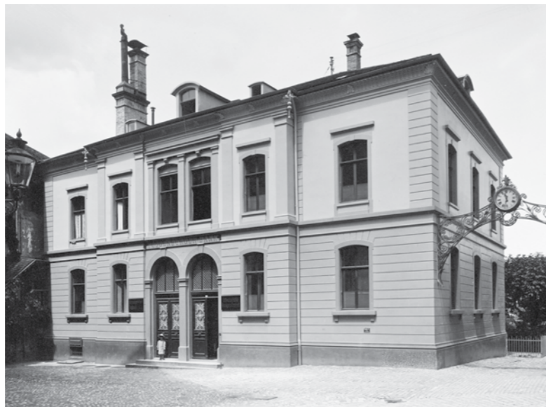
Building of the Union Bank of Switzerland in Lichtensteig, 1914.