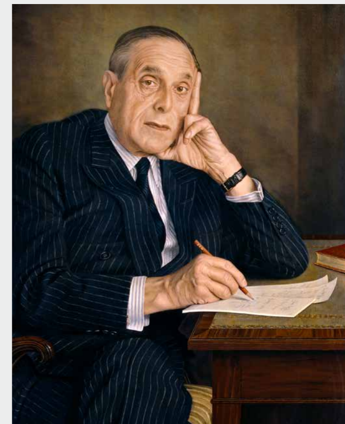
Siegmund Warburg, 1972.

writer for equity. It maintained the top position in M&A in the UK, the top position in European equities research and ranked among the top five in international equity underwriting. Yet, during the very same year, Warburgs’ expenditure on salaries and related items rose massively, yet returns did not keep up. Even worse than the financial woes created by the expensive expansion in the US was the effect of the 1994 collapse in international bond markets. On 2 May 1995, the day before the bank announced a profit warning for the previous financial year ended on 31 March, an unforeseen piece of information was unveiled to the public when Warburgs disclosed that it was examining an offer from SBC for its investment banking business. One week later, on 10 May, Warburgs’ (last) financial results were published. On the very same day, SBC’s acquisition of the merchant bank for 860 million pounds was announced.