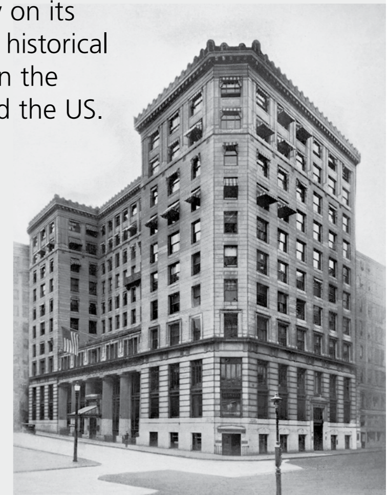
Paine, Webber & Co., Boston, about 1907.

UBS's global business presence draws heavily on its strong historical roots in the UK and the US.