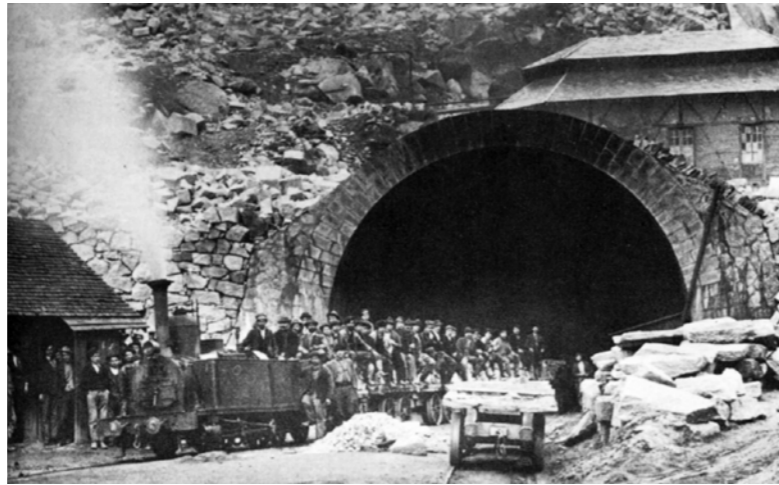
Construction of the Gotthard tunnel, 1880.

Basel’s proximity to Germany helped to shape the origins of the Basler Bankverein. Prussia’s defeat of France in 1870/71 and the subsequent unification of Germany into the German Empire sparked an economic and financial boom in Germany that also left its mark on Switzerland. Not only was the protocol for the formation of the Basler Bankverein signed in Frankfurt, but a German bank provided the capital, in concert with the six Basel-based private banking houses.