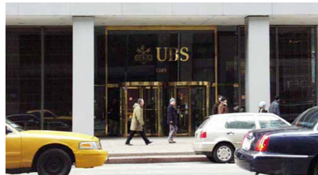
UBS, Avenue of the Americas, New York.

In December 1997, the Union Bank of Switzerland and SBC announced that they would join forces to create UBS, thus laying the foundations for a global and integrated financial services firm.