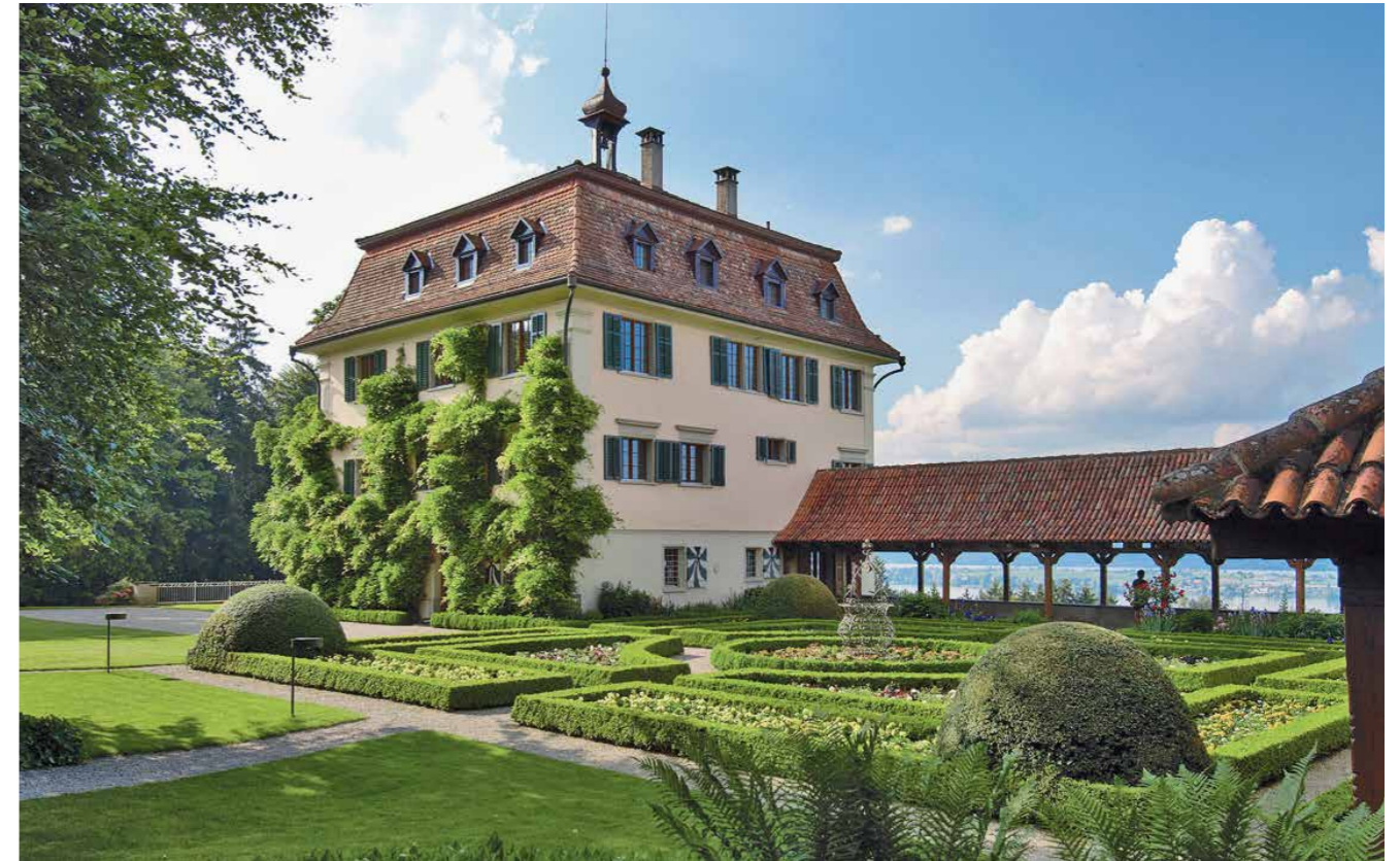
Château Wolfsberg, home to the UBS Center for Education and Dialogue.

In the course of their negotiations, both the Union Bank of Switzerland and SBC had faced challenges that influenced their opinion of the necessity and timing of a merger.