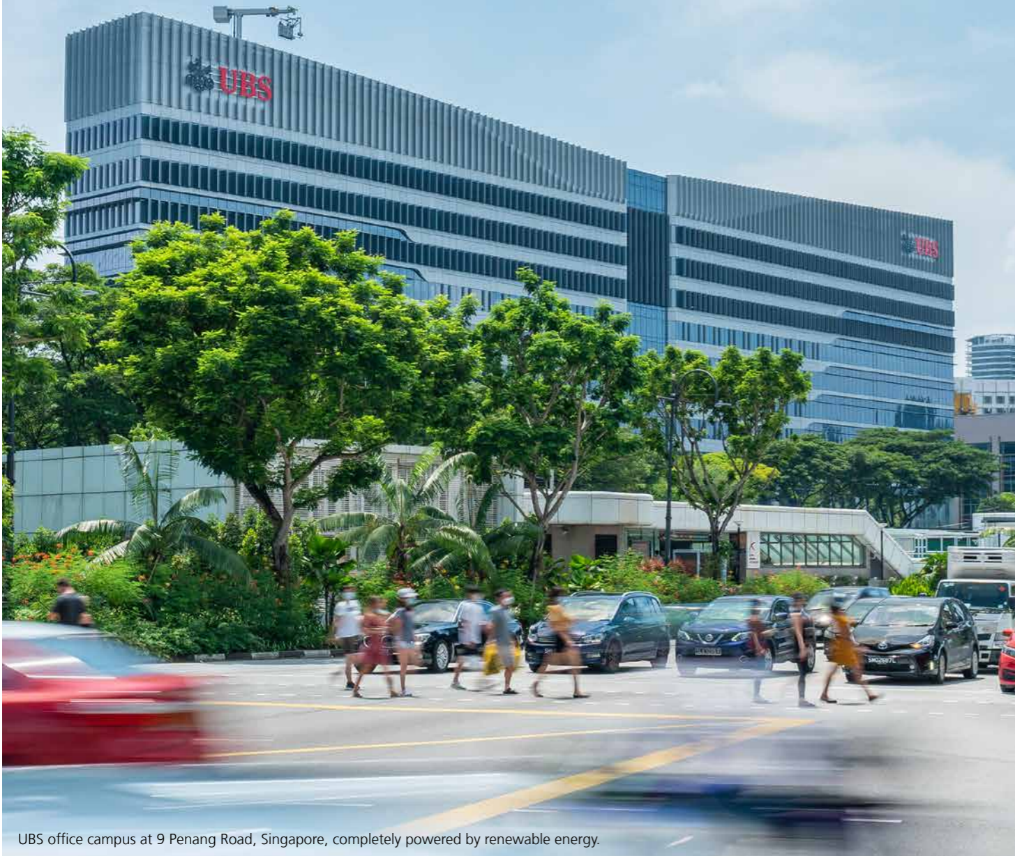
UBS office campus at 9 Penang Road, Singapore, completely powered by renewable energy.