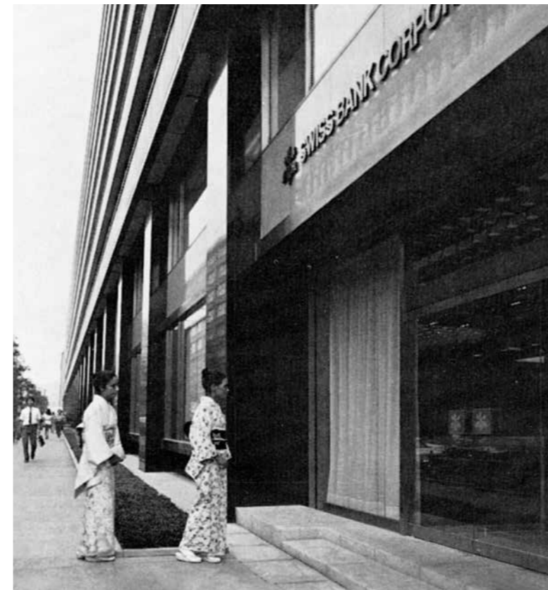
SBC offices in Tokyo, 1971.

By the early 1970s, SBC and the Union Bank of Switzerland were represented on all continents, from Australia to East and Southeast Asia to South Africa and across the Americas.