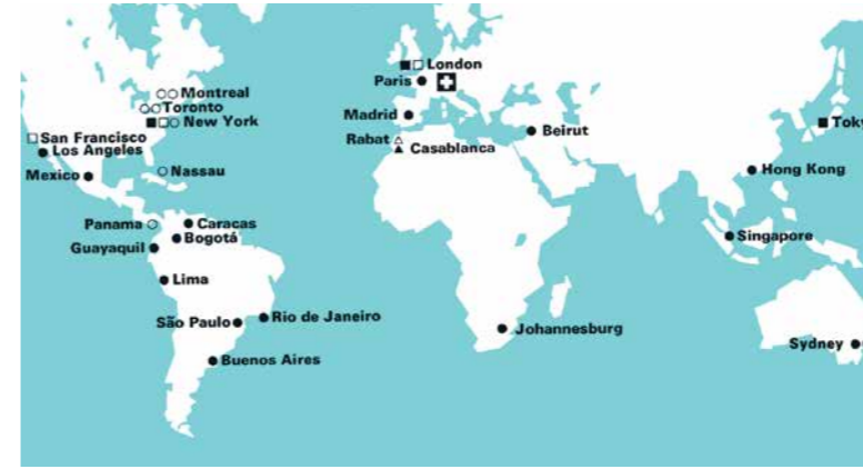
SBC’s global presence in the late 1960s.

By the early 1970s, SBC and the Union Bank of Switzerland were represented on all continents, from Australia to East and Southeast Asia to South Africa and across the Americas.