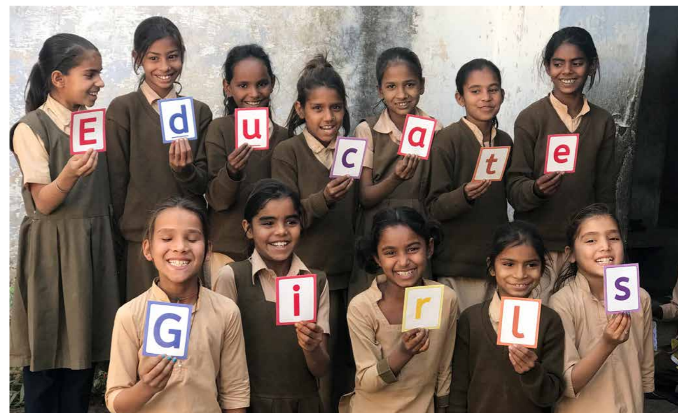
UBS Optimus Foundation, part of our Philanthropy offering, focuses on working with grantees in education, health, environment and child protection.

One year before celebrations began to mark 50 years of doing business in Asia Pacific, UBS (China) Limited opened officially in Beijing in 2013 to capitalize on long-term growth opportunities. And UBS continued to take root in China throughout the following years, with a new branch in Shanghai, a new Business Solutions Center in Wuxi, and UBS University in Shanghai all opening in 2016, supplementing existing campuses in the US, Europe and India.