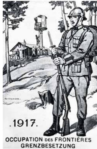
Switzerland in the First World War.