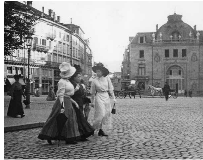
SBC building on Paradeplatz, Zurich, about 1904.

In 1912, the Bank in Winterthur and the Toggenburger Bank merged to form the Union Bank of Switzerland.