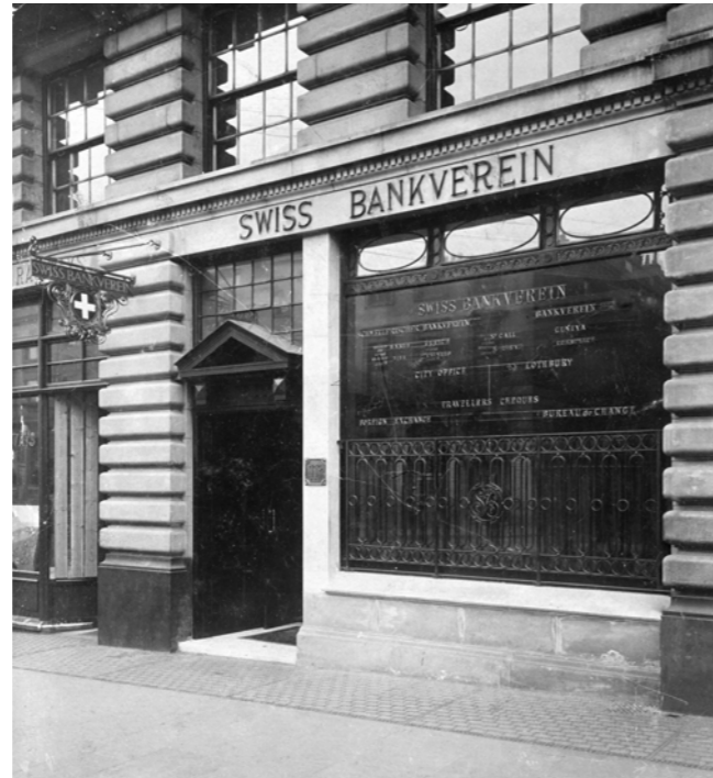
SBC London at 11C Regent Street, about 1912.