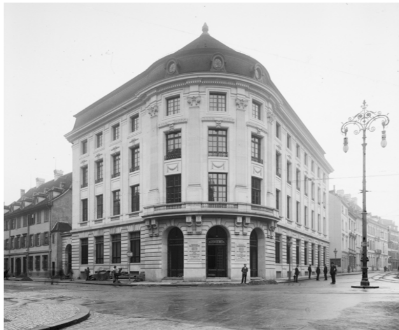
SBC in Basel, 1909.