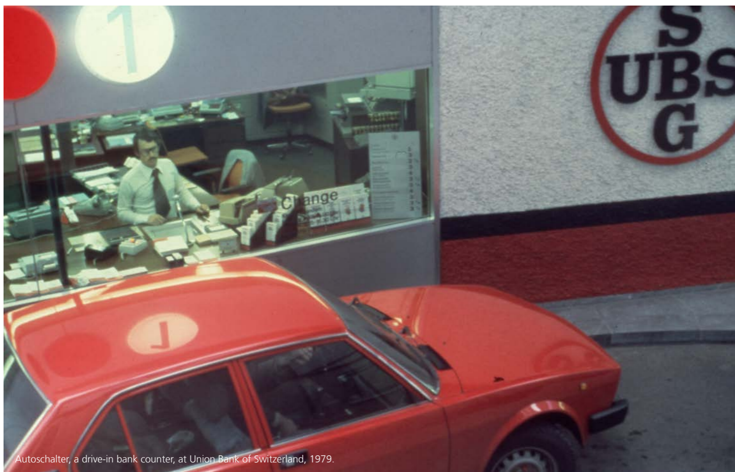
Autoschalter, a drive-in bank counter, at Union Bank of Switzerland, 1979.