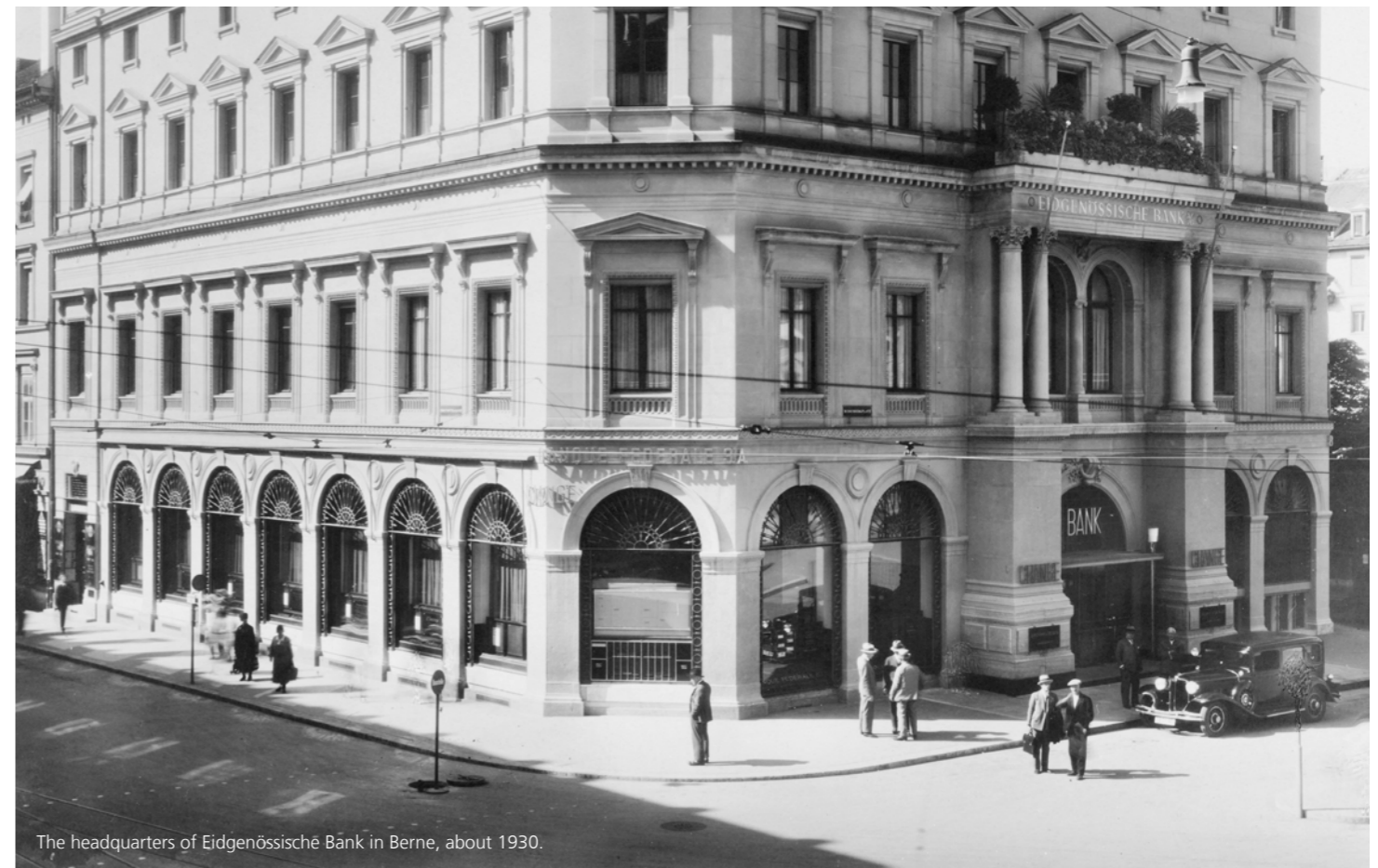
The headquarters of Eidgenössische Bank in Berne, about 1930.

The merger of the Union Bank of Switzerland and SBC bequeathed to the new bank three major asset management operations, which were subsequently combined in the single UBS Global Asset Management division in April 2002: Phillips & Drew and UBS Asset Management from the Union Bank of Switzerland side and Brinson Partners from the SBC side. The latter firm had been established in 1989 after a management buyout of First Chicago Investment Advisors, the asset management subsidiary that First National Bank of Chicago had set up in 1984. In 1994, when the firm accepted SBC’s purchase offer, Brinson Partners had 10 managing partners and 250 employees. Its headquarters were in Chicago, with offices in London and Tokyo.