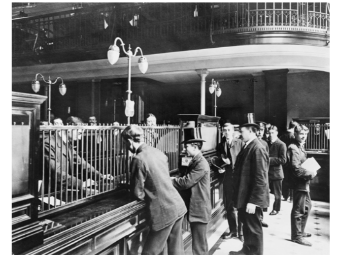
SBC in London at 43 Lothbury, cashiers’ counter, 1908.

At the beginning of the 20th century, not a single Swiss bank was ranked within the global top 50 banks.