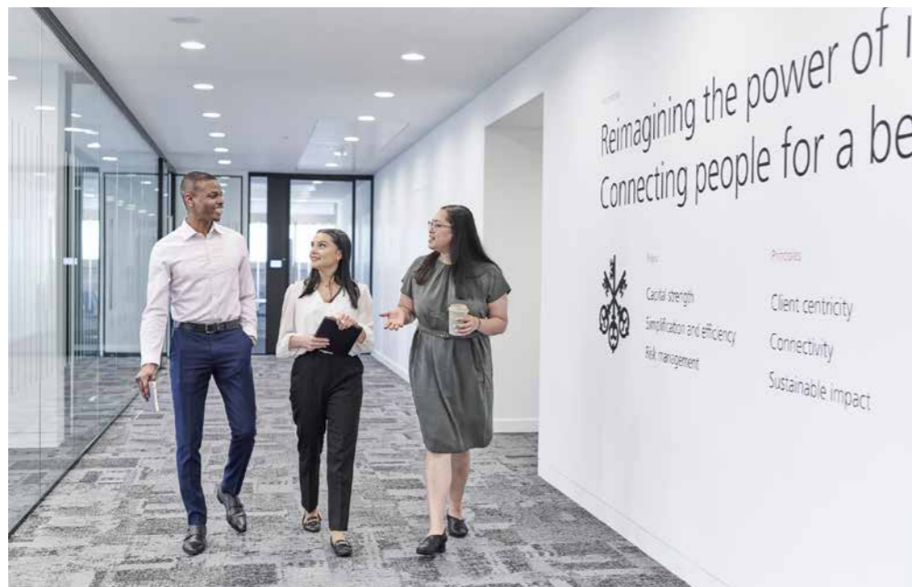
Our purpose statement.

investment banking services in Latin America and institutional securities brokerage in Brazil. While these strategic partnerships created new encouraging opportunities, the year 2020 also highlighted new risks of a globalized world. The impact of the COVID-19 pandemic on the world economy was severe and brought increased hardship to communities all over the world. As a global financial institution, UBS committed resources and support to various aid projects. From a business side in this very challenging year, UBS remained close to its clients, helping them navigate uncertainty and offering them, above all, stability and dependability, as well as its well-known tailored advice and solutions. The firm also demonstrated how years of sustainable thinking and acting delivered value for all stakeholders, by allowing strengthened support for business owners during the crisis. Technology investments that long preceded the virus outbreak allowed the firm's employees to transition from the workplace to home office. As the pandemic rolled on, it became clear that economies must better prepare for global systemic risks, including climate change.