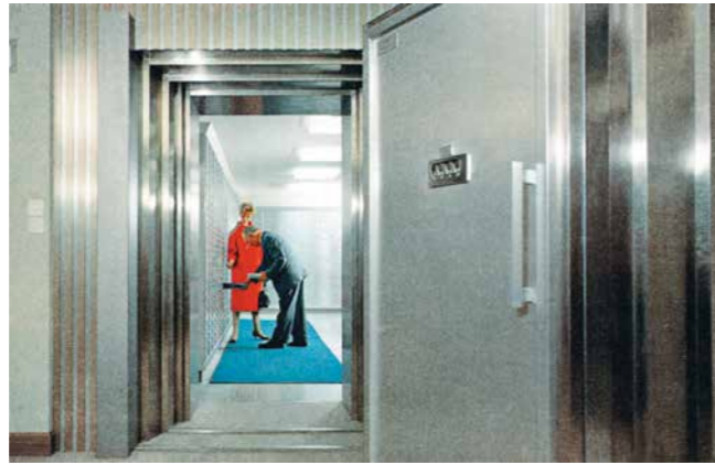
Strong room at Union Bank of Switzerland, early 1960s.

In many ways, the 1960s proved to be a decisive period for both banks – with expansion and innovation at home and abroad. Important milestones included the June 1960 opening of SBC’s new office building on Zurich’s Paradeplatz, which replaced the bank’s original turn-of-the-century building. And when, in the early