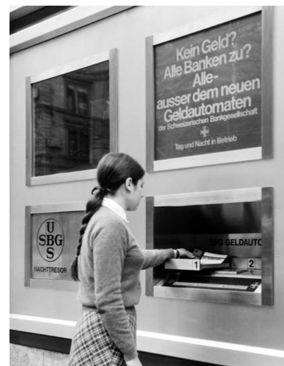
Switzerland's first automated teller machine (ATM), 1967.

By the end of the decade, however, both banks had taken to private and retail banking with enthusiasm.