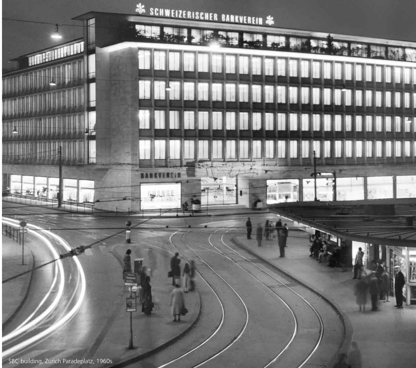
SBC building, Zurich Paradeplatz, 1960s.