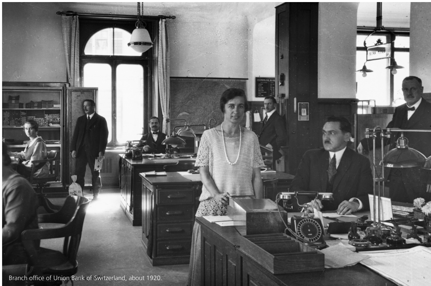
Branch office of Union Bank of Switzerland, about 1920.

Initially concentrating on international commercial banking activities – including providing loans for the development of railways in East Asia – SBC in London soon expanded its activities with the acquisition of the private banking house Blake, Boissevain & Co. This gave SBC access to an extensive securities business in Holland and the US as well as greater contacts in Switzerland and Germany. A second branch was set up in February 1912 in London’s West End next to the Swiss Railways office in order to service the lucrative travel and tourist trade. After the upheavals of the First World War, SBC quickly managed to (re-)establish itself as one of the leading foreign banks in London. Giving unmistakable evidence of SBC’s innovative and forward-looking spirit, it was in its new building on the corner of Gresham Street and Coleman Street that the first inhouse telephone exchange in London was installed.