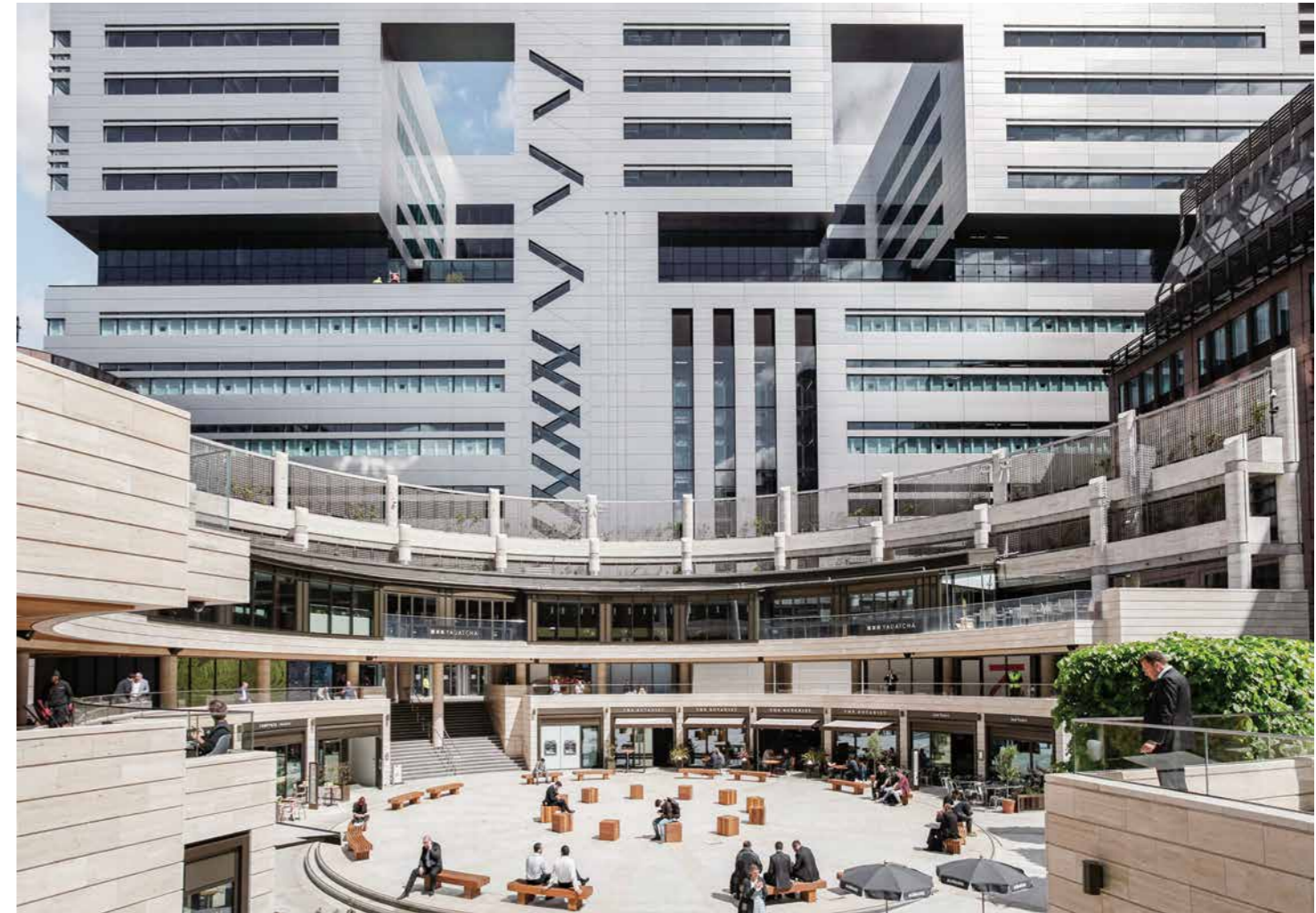
5 Broadgate, UBS’s London headquarters, opened in 2016.

In 2019, UBS established a strategic wealth management partnership with Sumitomo Mitsui Trust Holdings in Japan, creating the first one-stop shop for all of the needs of high net worth and ultra high net worth individuals in Japan. Only a year later, the firm entered a strategic partnership with Banco do Brasil. This jointly owned entity provides