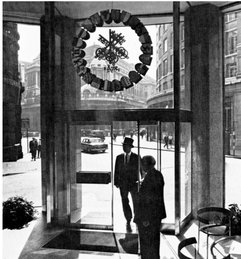
SBC in London in the 1960s.