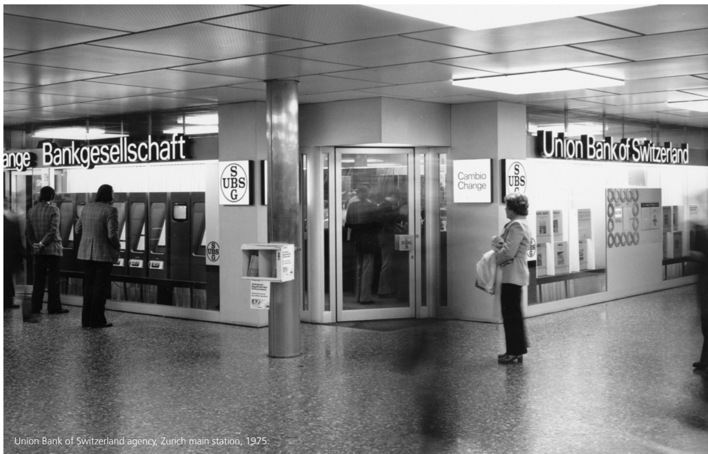
Union Bank of Switzerland agency, Zurich main station, 1975.