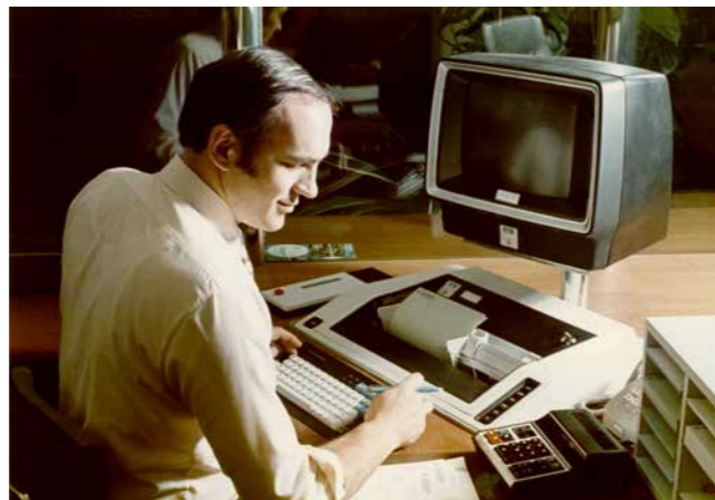
Release of Real Time Banking at SBC, 1979.