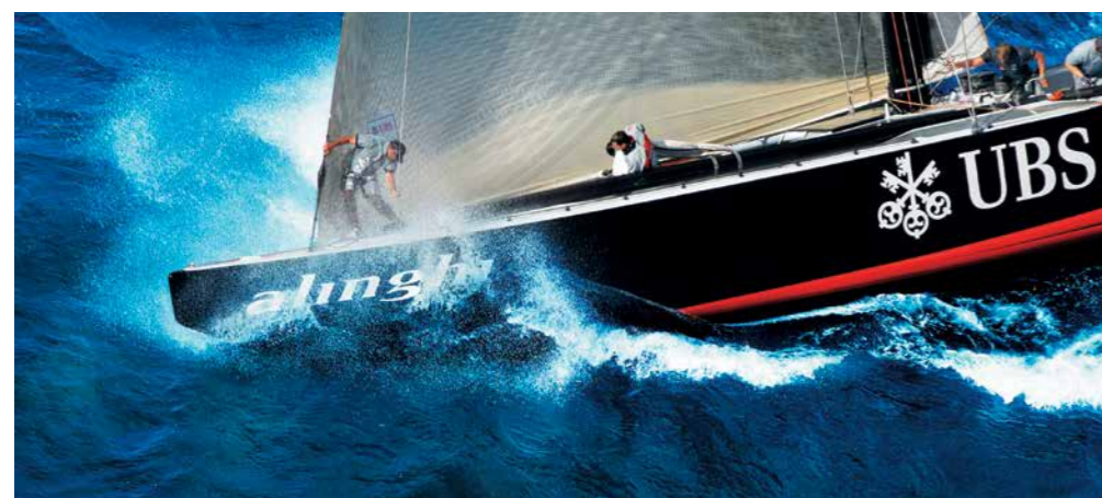
In 2003, UBS is main sponsor of Alinghi , the first European sailing yacht to win the America's Cup.

In regional terms, UBS saw strong organic growth in the Asia Pacific region, focusing on the leading financial centers Hong Kong and Singapore, building a targeted presence in key onshore markets, such as Japan and Taiwan, and further strengthening local presence in China.