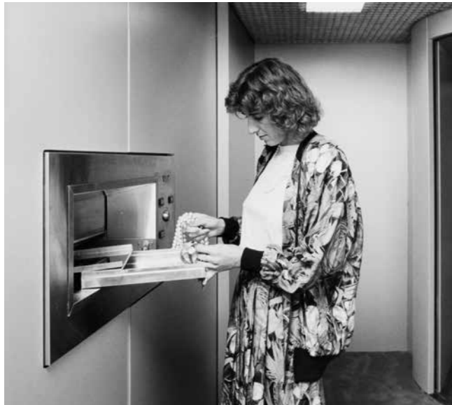
First electronic banking branch in Zurich, 1986.