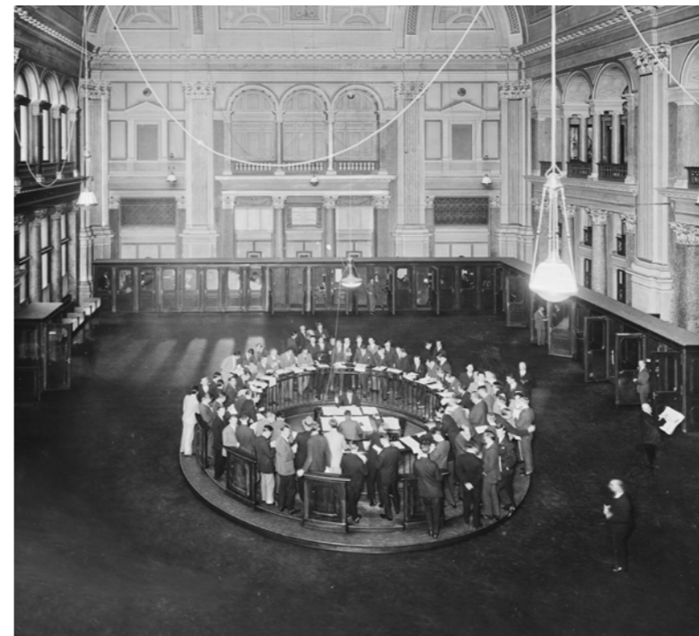
Zurich Stock Exchange, about 1910.

In 1912, the Bank in Winterthur and the Toggenburger Bank merged to form the Union Bank of Switzerland.