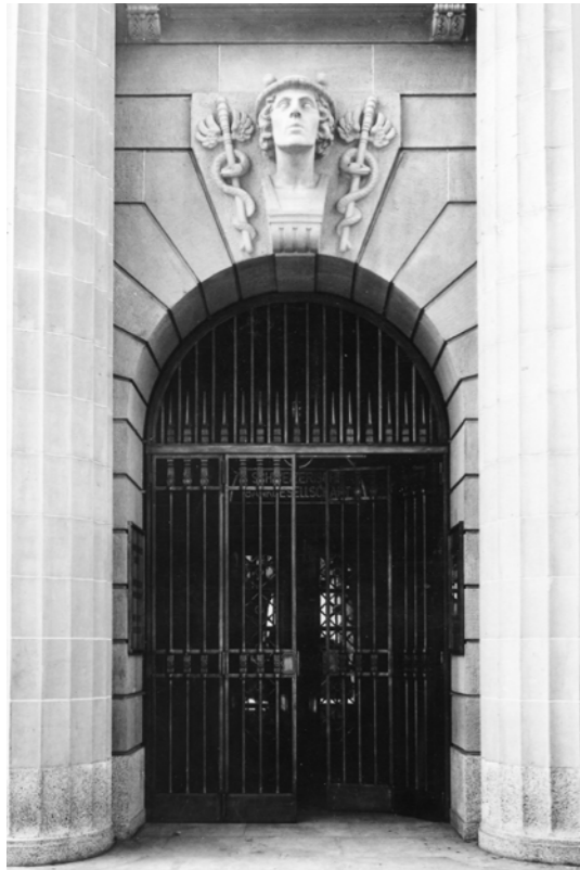
Union Bank of Switzerland, Münzhof, Bahnhofstrasse 45, Zurich, 1919 (left) and 1926 (right).